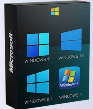
All Windows Versions