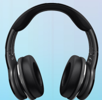
Headphones & speakers